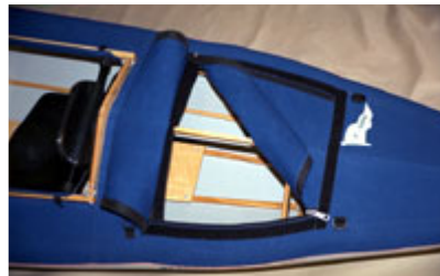
rear loading hatch

The rear loading hatch included on all Aeries Quattro II 520 is sealed with velcro flap and opens with a zipper as shown on this blue boat.